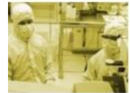
Cleanroom Management and Manufacturing Automation

To support photonics designers in an electronics environment, Phoenix Software and Mentor Graphics are working together to bring photonics design capabilities into EDA tools and to create a Unified Design Flow. Available for customer evaluation is a coherent integration of OptoDesigner with Pyxis Schematic and Pyxis Layout to support the generation of the photonics elements and components. OptoDesigner's photonic building block platform enables designers to define optical or geometrical specifications in the schematic and/or layout and OptoDesigner will provide the actual layout implementation and provide parameters back to Pyxis. With the recent acquisition of Tanner EDA by Mentor Graphics, the teams are working now on the same level of integration with L-Edit and S-Edit, to support customers using MS Windows as operating system. Read more >