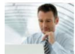
Chip Design Solutions

Building on the long history of the two week in-depth courses at the Eindhoven University of Technology, these 5-days intensive JePPIX training courses focus on supporting the creation of designs to be fabricated in MPW runs at SMART Photonics, Oclaro, the FhG-Heinrich Hertz Institute and Lionix. People that want to learn more about photonic integration in general as well as people interested to participate in a MPW run and learn more about Design Tools and Design Kits to design Photonic ICs should join. Phoenix Software Application Engineers will provide hands-on training.